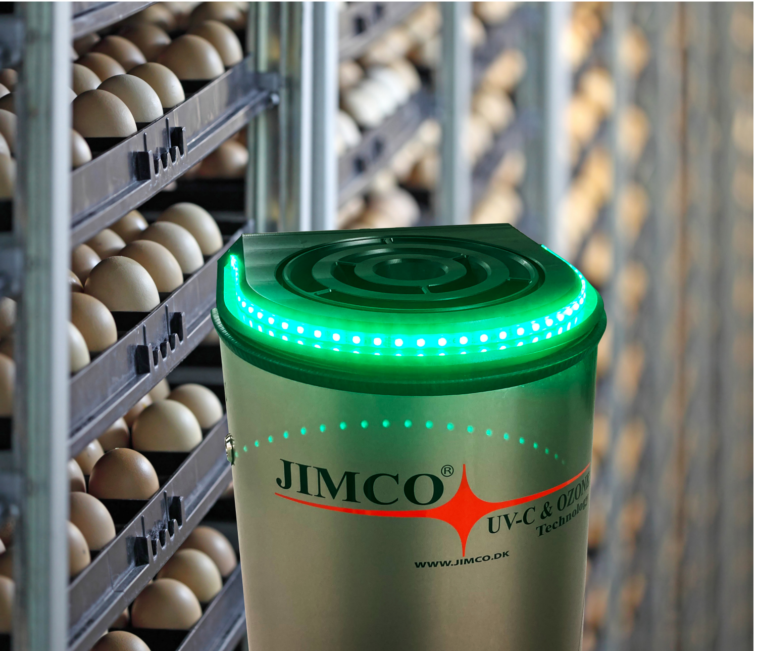
JIMCO UNIT FLO-D Mini Mark 2

FLO-D is developed with a single purpose in mind: ensuring food safety through effective surface disinfection. Our technology combats bacteria and pathogens that could compromise the quality of food.